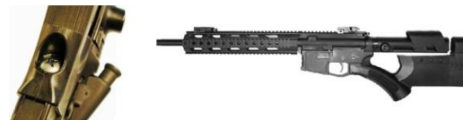
GEN III NY Configuration