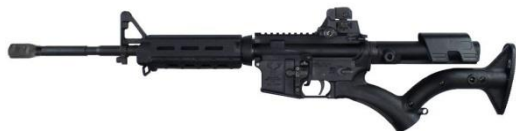
GEN I & II CA Configuration

(3) A semiautomatic, centerfire rifle that has an overall length of less than 30 inches.